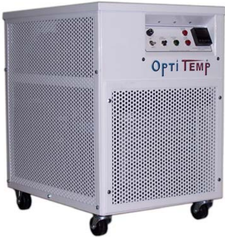
Model OTC-.25A to OTC-.5A shown

A partial list of Process Cooling Markets: Aero. & Defense, Digital Printing, Food & Beverage, Mobile Imaging, Plastics Photonics, Research & Semi-Conductor.