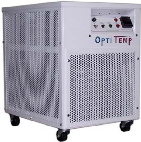
Model OTC-.5W-OTC-.75W Shown

A Partial List of Process Cooling Markets: Aero. & Defense, Digital Printing, Food & Beverage, Mobile Imaging, Plastics Photonics, Research, & Semi-Conductor.