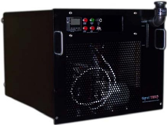
Model OTC-R33W to OTC-R75W shown

A Partial List of Process Cooling Markets: Aero. & Defense, Digital Printing, Food & Beverage, Mobile Imaging, Plastics Photonics, Research, Semi-Conductor.