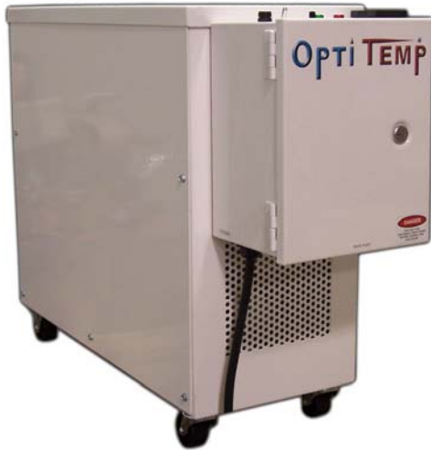
Model OTI-5W to 15W shown

A Partial List of Process Cooling Markets: Aero. & Defense, Digital Printing, Food & Beverage, Mobile Imaging, Plastics Photonics, Research, & Semi-Conductor.