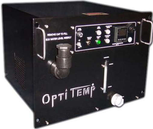
Model OTI-R1W to R15W shown

A Partial List of Process Cooling Markets: Aero. & Defense, Digital Printing, Food & Beverage, Mobile Imaging, Plastics Photonics, Research, & Semi-Conductor.