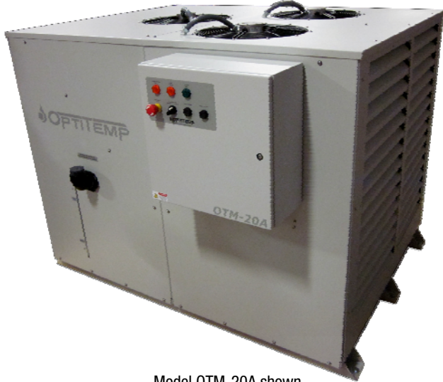
Model OTM-20A shown

A Partial List of Process Cooling Markets: Aero. & Defense, Digital Printing, Food & Beverage, Mobile Imaging, Plastics Photonics, Research, & Semi-Conductor.