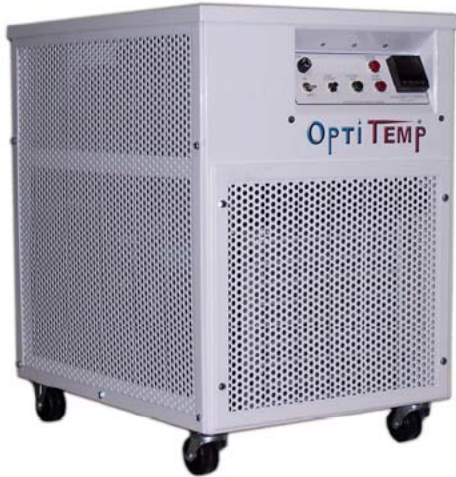
Model OTC-.25A to OTC-.5A shown

A partial list of Process Cooling Markets: Aero. & Defense, Digital Printing, Food & Beverage, Mobile Imaging, Plastics Photonics, Research & Semi-Conductor.