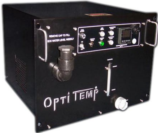
Model OTI-R1W to R15W shown