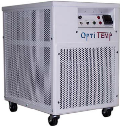
Model OTC-.25A to OTC-.5A shown

A partial list of Process Cooling Markets: Aero. & Defense, Digital Printing, Food & Beverage, Mobile Imaging, Plastics Photonics, Research & Semi-Conductor.